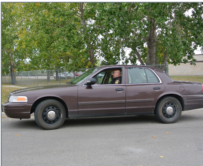
Winnipeg Police Traffic Enforcement in School Zone

To date, CN has been unable to provide the timely and sustained resources required for the City to meet previously anticipated accomplishment targets. The City has requested an extension to the project completion date from funding partners. However, it remains the City's primary goal to have at least two lanes open to traffic on Plessis Road by the end of December, 2014.