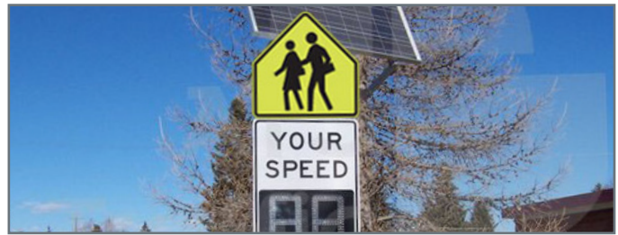
Dynamic Speed Display Sign