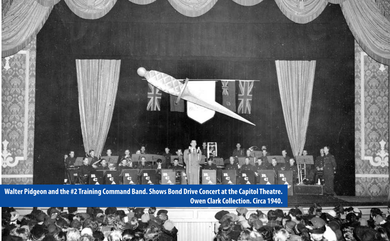
Walter Pidgeon and the #2 Training Command Band. Shows Bond Drive Concert at the Capitol Theatre. Circa 1940.