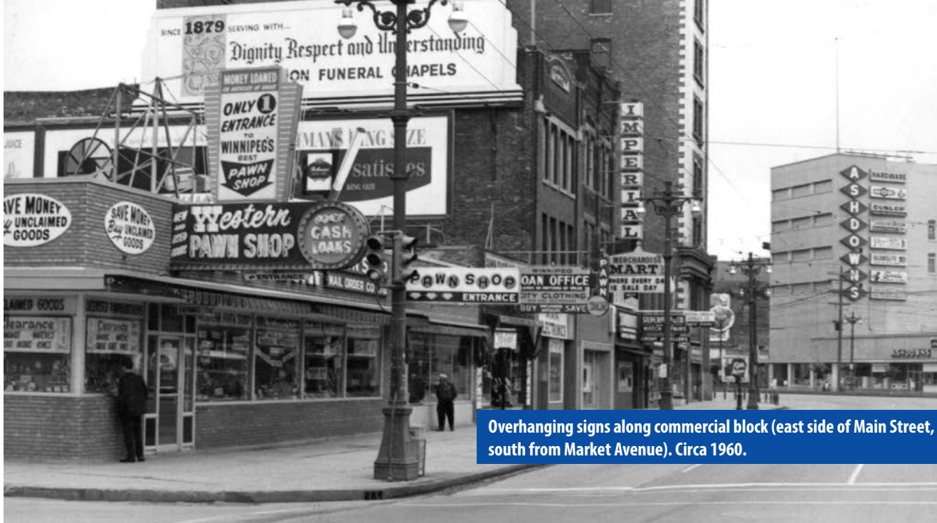
Overhanging signs along commercial block (east side of Main Street, south from Market Avenue). Circa 1960.