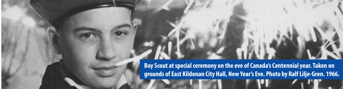
Boy Scout at special ceremony on the eve of Canada's Centennial year. Taken on grounds of East Kildonan City Hall, New Year's Eve. 1966.