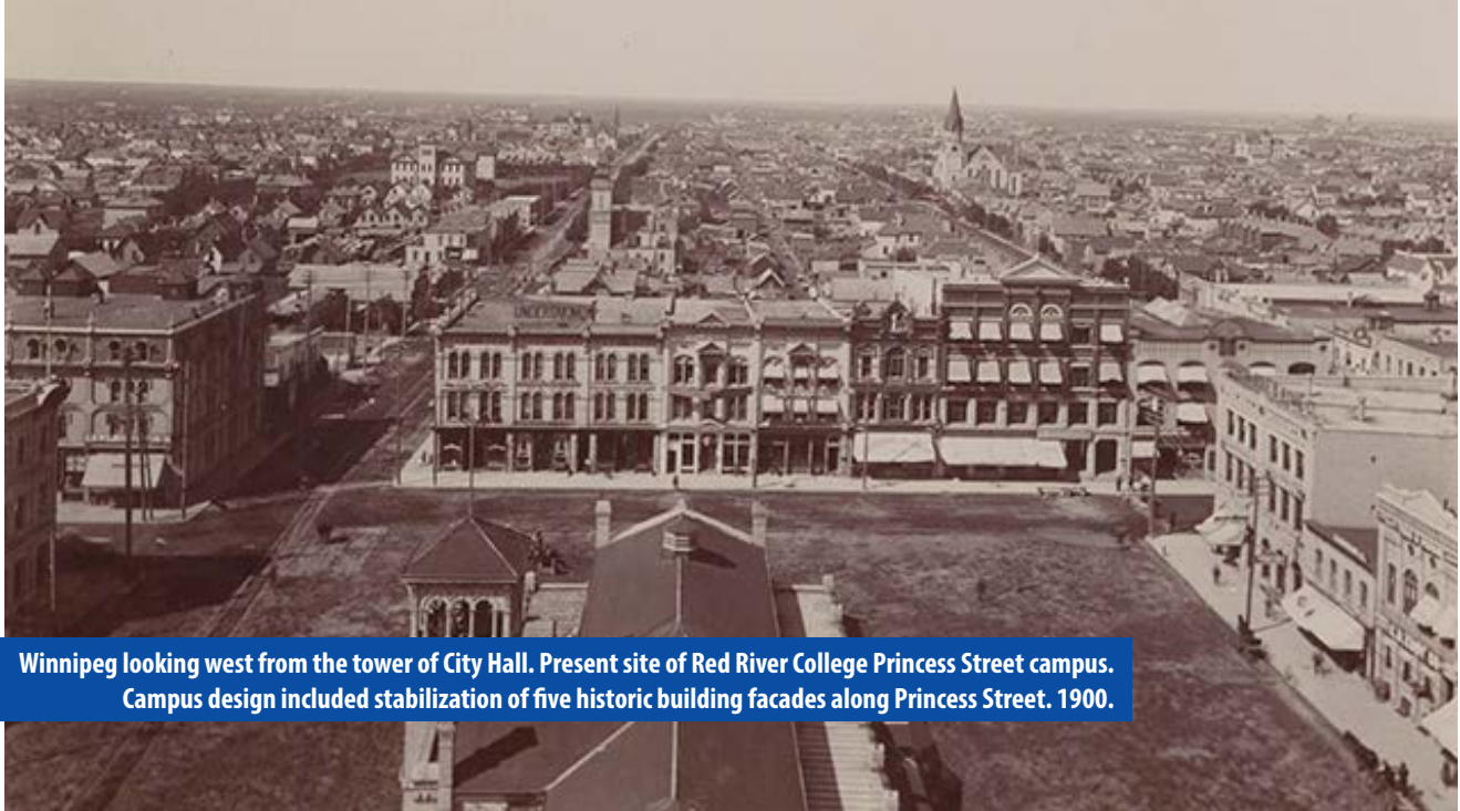
Winnipeg looking west from the tower of City Hall. Present site of Red River College Princess Street campus. Campus design included stabilization of five historic building facades along Princess Street. 1900.