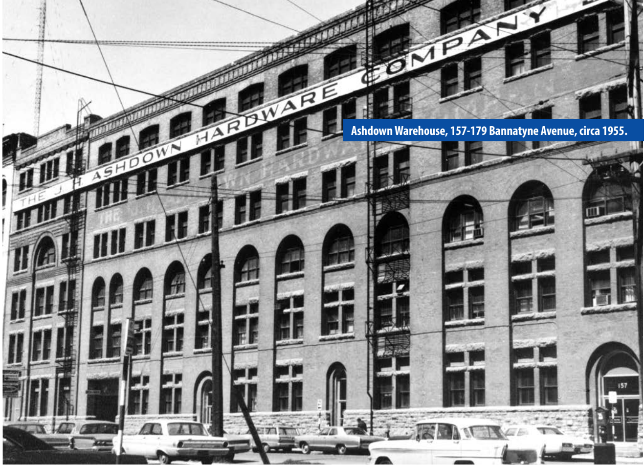
Ashdown Warehouse, 157-179 Bannatyne Avenue, circa 1955.