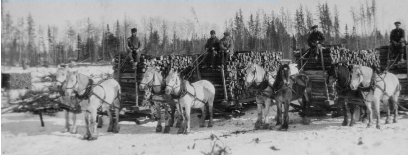
Teamsters at City of Winnipeg Wood Camp, Greater Winnipeg Water District Railway. Circa 1930.