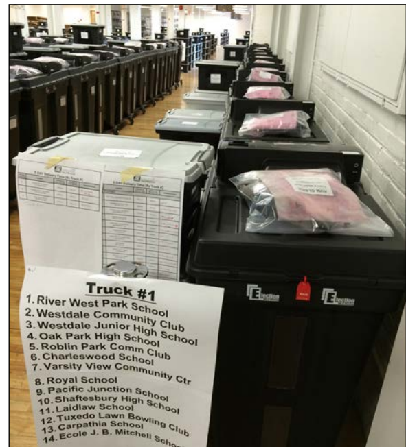
Election equipment and supplies staged for shipment prior to Election Day, October 2014.

In addition to Branch programming, staff worked with City Clerk's colleagues to deliver the 2014 civic election. As always, significant staff time was required to prepare election equipment and ballots for advance and election day voting; to train the more than 2000 election workers required to staff 192 voting places; and to pack and ship out voting supplies. On Election Day – Wednesday, October 22 – the Branch was closed and staff were either at Election Headquarters manning phones or responding to questions and issues in the field. Following Election Day, staff were on site at the Corporate Records Centre to receive and secure vital records as they returned from the 192 voting places used for the election.