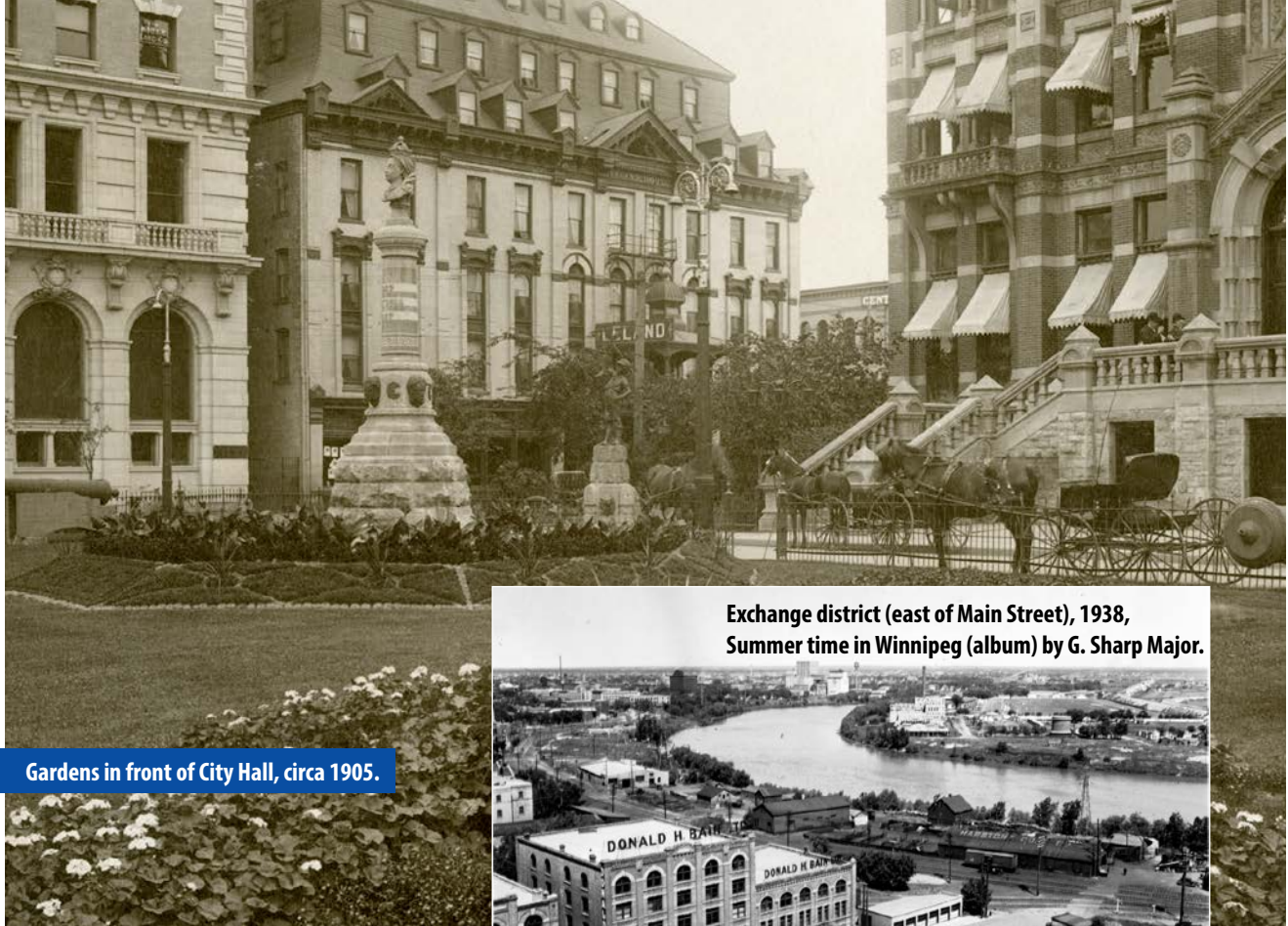
Gardens in front of City Hall, circa 1905.