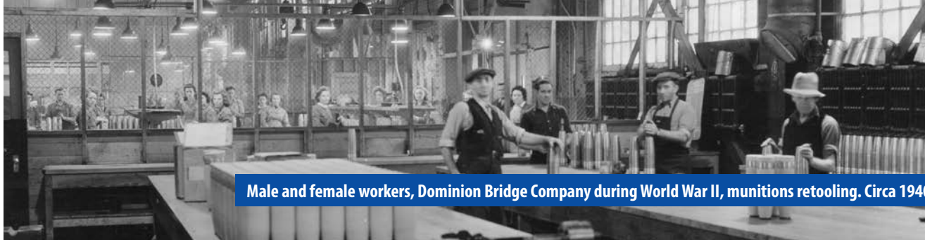
Male and female workers, Dominion Bridge Company during World War II, munitions retooling. Circa 1940.