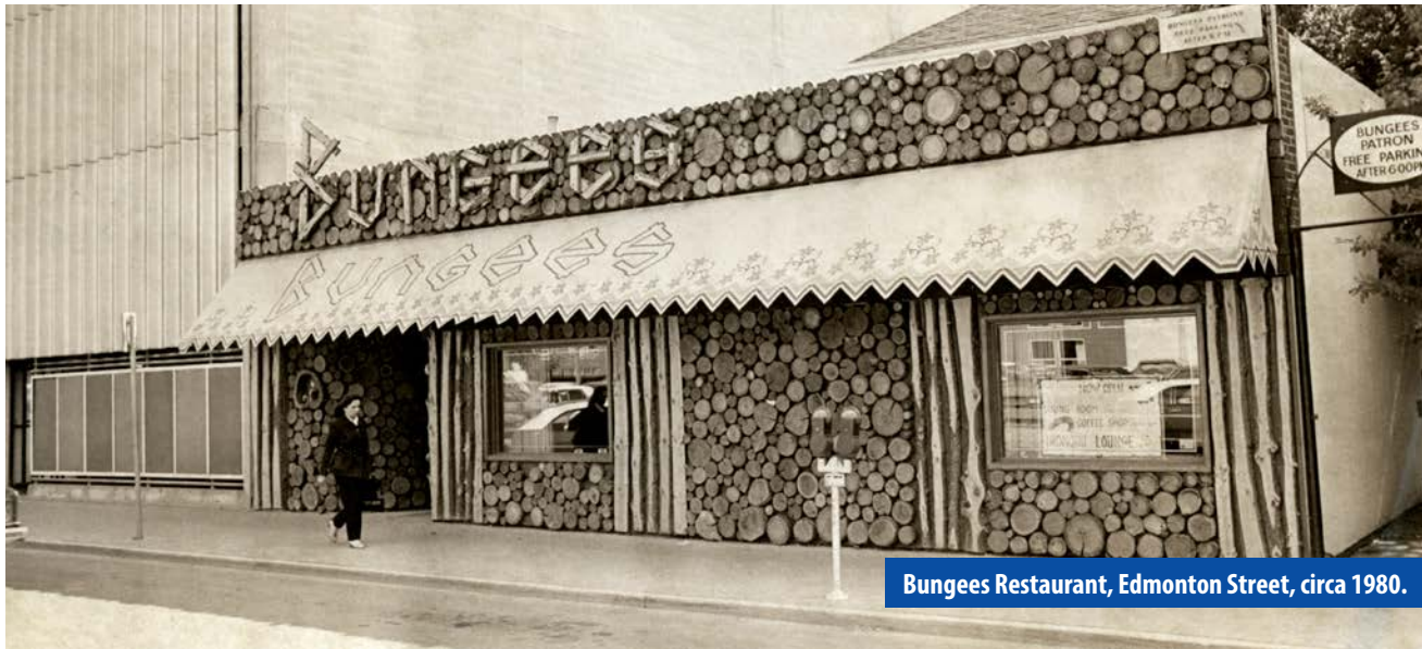
Bungees Restaurant, Edmonton Street, circa 1980.